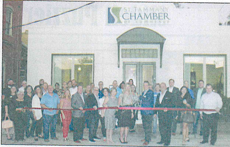
A ribbon cutting was held in front of the Chamber office at 2220 Carey Street.